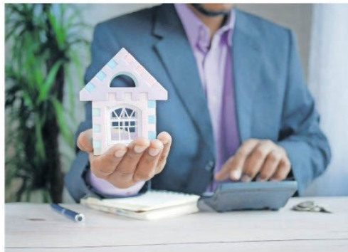
AN ELECTION can have either a good or bad impact on property.

However, Clarke advises caution, noting potential slumps in luxury segments as investors await election outcomes. Yet, positive election results could trigger a